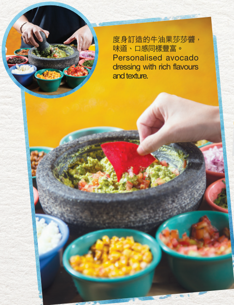
度身訂造的牛油果莎莎醬，味道、口感同樣豐富。 Personalised avocado dressing with rich flavours and texture.

The first restaurant to offer Table-Side Guacamole in Hong Kong, Coyote prepares a personalised avocado salad dressing on the spot, using ingredients you select. Choose a combination of 9 different ingredients including bacon, black olives and grilled corn, and add a whole new dimension to this traditional Mexican dish.